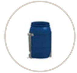
Stratasys H350 powder container

Solution for Stratasys H350 printer or your choice