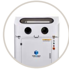
Powder retrieval station

Solution for Stratasys H350 printer or your choice