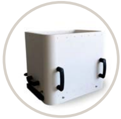
Stratasys H350 build removal box